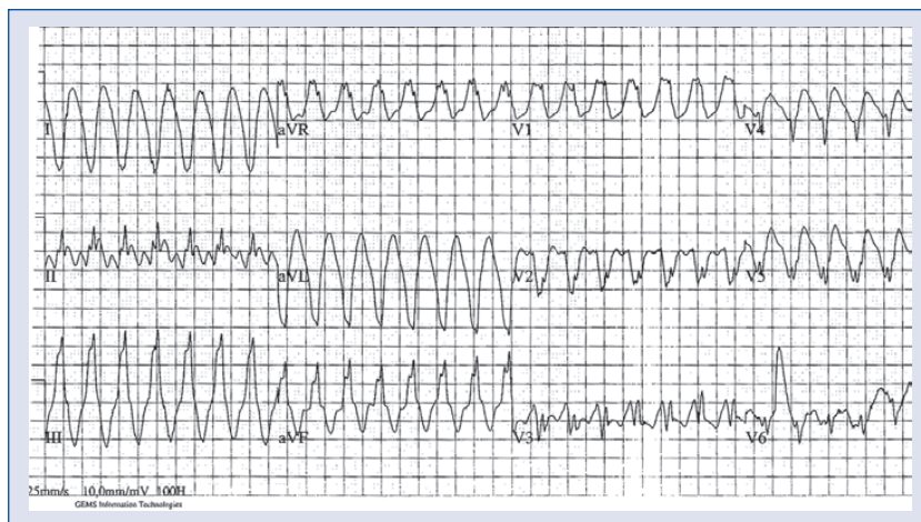
Figure 1. ECG when patient presented dizziness and palpitations with ventricular tachycardia.

posterior wall thickness of 16 mm, and a left ventricular ejection fraction of 62%. There was neither mitral valve systolic anterior motion, nor left ventricular outflow tract obstruction. At that time, she had non-sustained VT on a 24-hour ambulatory ECG recording, before any beta-blocker treatment was initiated.