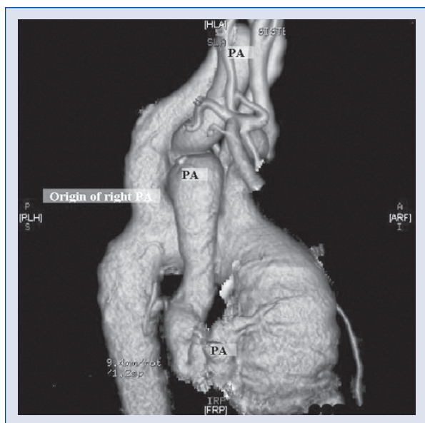
Figure 1. Axial computed tomography image showing right pulmonary artery (PA) arising from the arcus aorta.

The authors do not report any conflict of interest regarding this work.